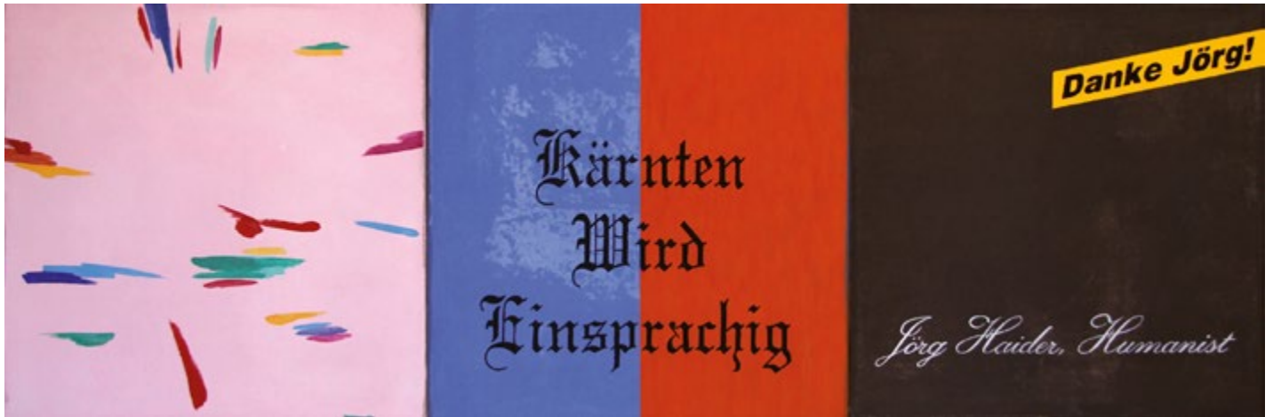
Koroški triptih #7 / Carinthian triptych #7