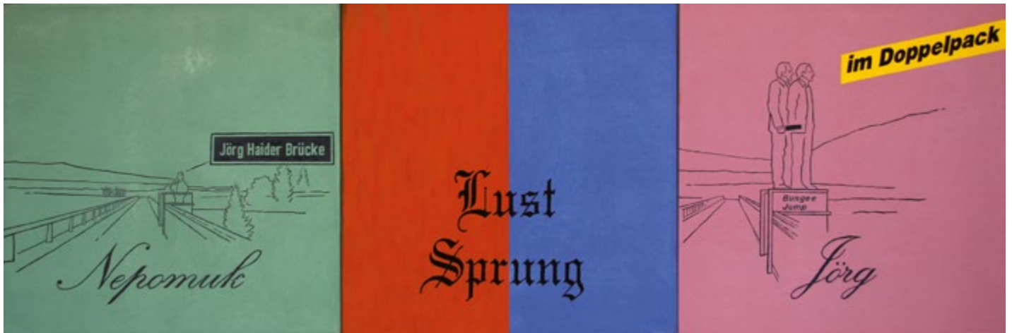
Koroški triptih #8 / Carinthian triptych #8