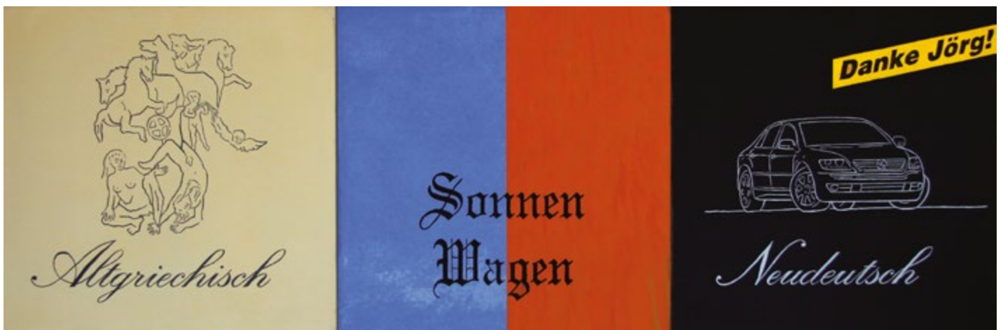
Koroški triptih #9 / Carinthian triptych #9