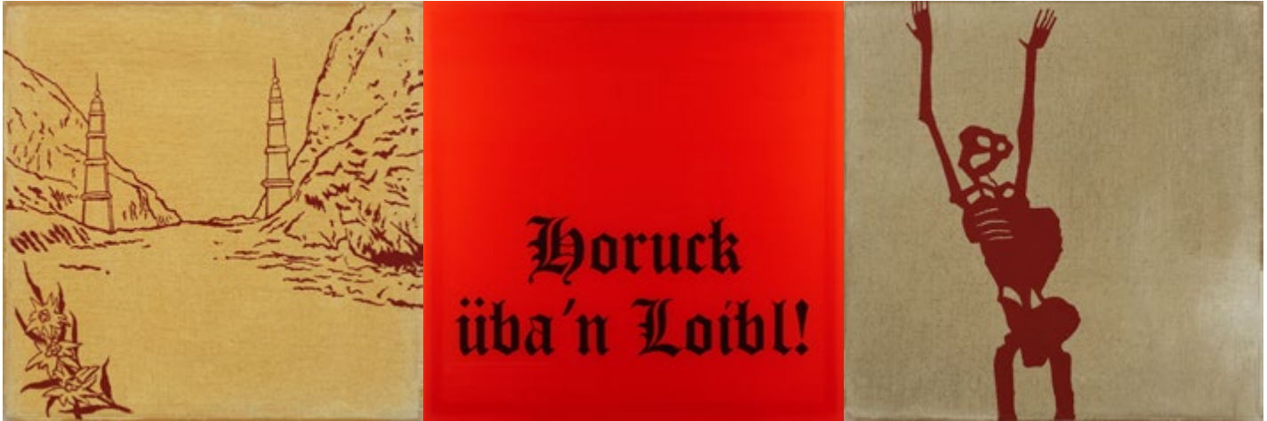
Koroški triptih #1 / Carinthian triptych #1