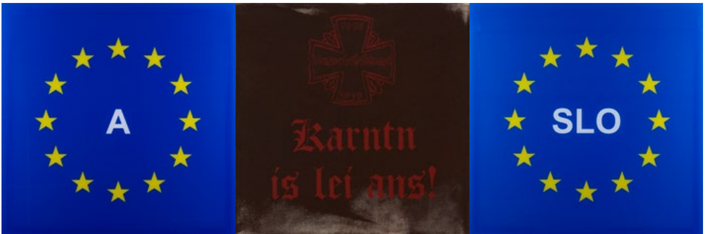
Koroški triptih #3 / Carinthian triptych #3