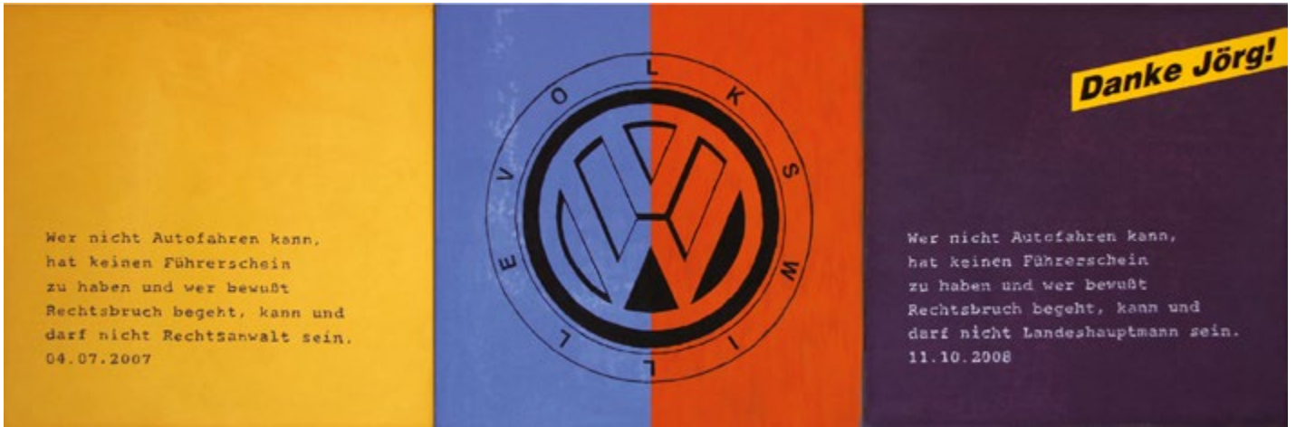
Koroški triptih #4 / Carinthian triptych #4