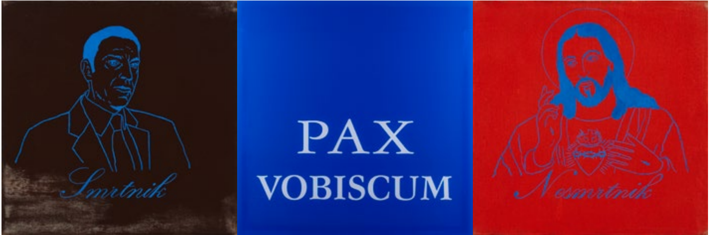
Koroški triptih #2 / Carinthian triptych #2